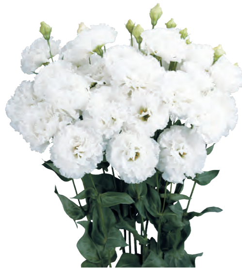
Celeb 1 Crystal (F17-308)

Its early maturity allows it to bloom in winter in warm climates. Its flower shape resembles that of Celeb 2 Crystal. It turns slightly ivory in winter.