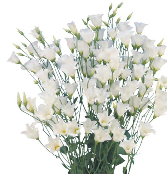
Macherie White (F06-079)

A sleek looking single variety with sword-shaped petal. Early maturing, easy to cultivate, and produces many flowers.