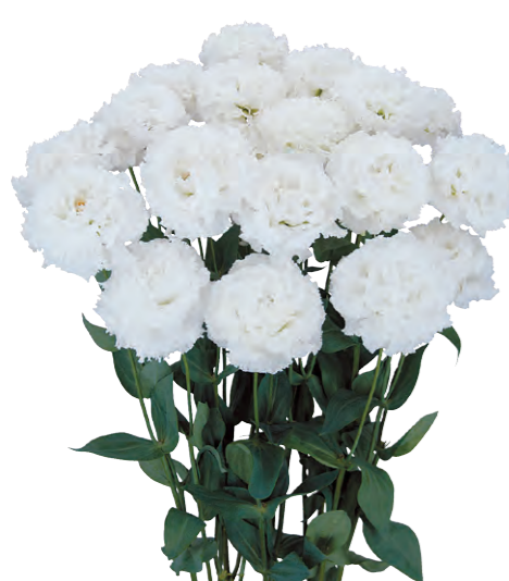
Celeb 2 White (F09-104)

It is characterized by its pure white color and uniformity. Keeping it well-watered even after buds appear will increase the volume of the flowers.