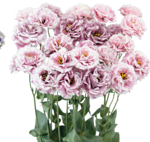
Celeb 2 Turn Red (F16-301) A medium-sized double flower with a reverse red picotee coloring. The white area becomes larger at high temperatures.