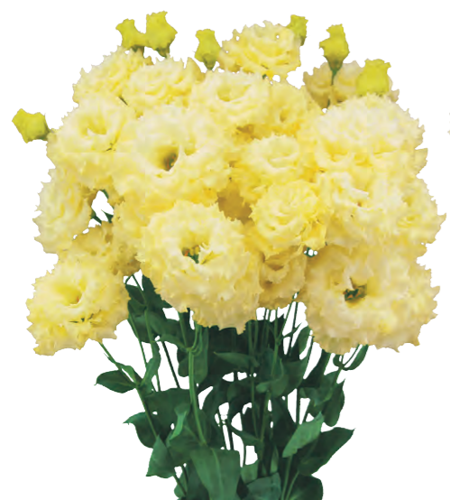
Celeb 2 Yellow (F09-105)

This is an easy-to-grow variety with a well-balanced flower shape, plant height, branching, and plant form. It is suitable for a wide range of cultivation segments.