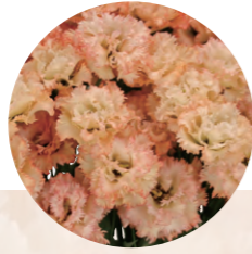
F20-928 Earliness : 2 Flower Size : Medium Rosetting : Average