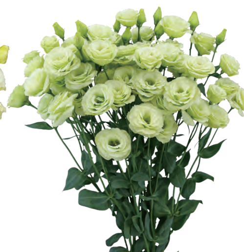
Arosa 2 Green (F08-931) Dark green, slightly soft stems, excellent flower quality and long shelf life.