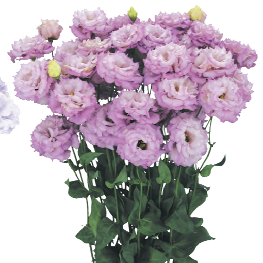
Celeb 2 Mid Grape (F11-134) Fringed reddish lavender color variety with firm flowers. It matures earlier than Celeb 2 Grape, has smaller flowers and more branches, and is better suited to growing in cooler seasons.