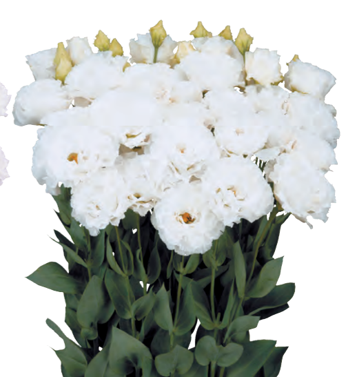
Elegance 3 Snow (F17-983)

A medium-large double flower with pure white color. Their maturity is same with Prime 3 White, with more fringes and volume to the sides.