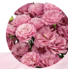
F21-001 Earliness : 2 Flower Size : Small Rosetting : Average