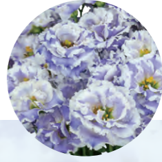
F21-241 Earliness : 2 Flower Size : Mid-Small Rosetting : Sensitive