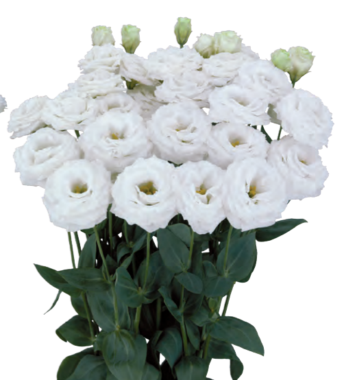
Wedding 2 Cake (F13-318)

A medium-sized, double-flowered variety with round petals. Good branching. Be careful of rosetting.