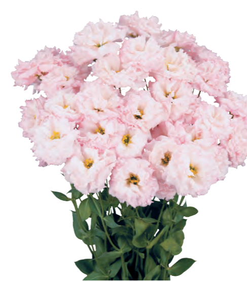
Celeb 1 Sakura Pink (F16-007)

An early maturity variety with a green core and a clean light pink petals. The color fades slightly in low light periods. The stems are sturdy.