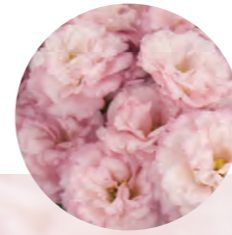
F21-057 Earliness : 2 Flower Size : Large Rosetting : Less sensitive