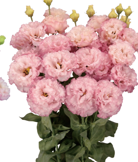
Celeb 2 Garnet (F15-348)

The flowers have dense petals and a strongly fringed shape. The light pink color does not fade even in winter. Be careful of tip burn.