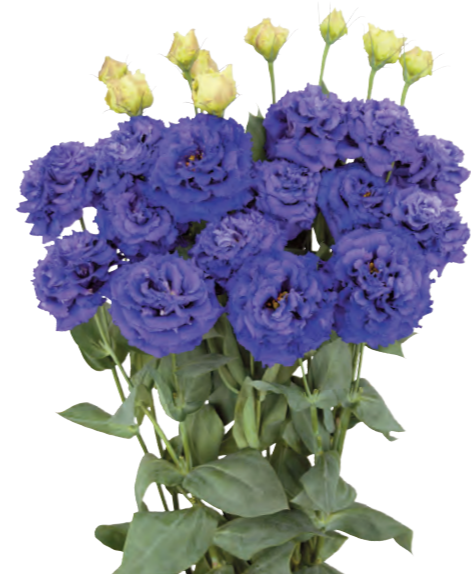
Celeb 2 Navy (F14-769) A blue variety from Celeb series. Although the fringes are not strong, the petals are layered and the plant branches even in autumn. It grows taller than other blue/violet varieties.