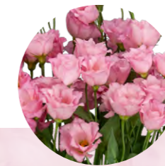
F20-203 Earliness : 2 Flower Size : Small Rosetting : Less sensitive