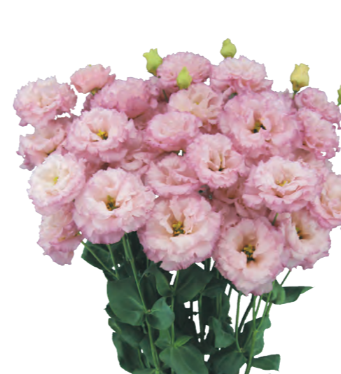
Celeb 2 Pink ver.2 (F19-664)

The flowers are deep pink and open wide. They are quite vigorous and nodes are long. Be careful not to let them stretch too much.