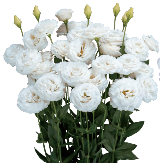
Arosa 2 Pure White (F19-422) Pure white, round petal variety. Many layers, blooms at the top, and multi-branched. It grows compactly, but has many branches, so it can produce a voluminous cut flower.