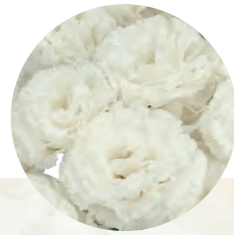
F17-049 Earliness : 1.5 Flower Size : Mid-Large Rosetting : Less sensitive