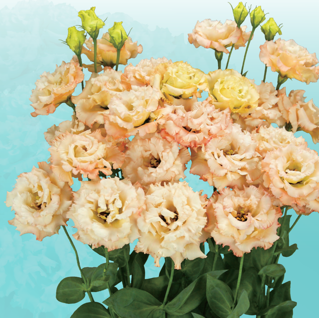
Celeb 3 Apricot (F18-948)

Large apricot-colored flower with subdued redness. Because the internodes tend to be long, it is recommended to cultivate it without letting it become too vigorous.