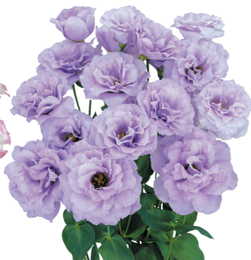
Megalo 3 Wisteria (F11-634) A large, voluminous lavender variety with relatively short internodes. Top flowering, and flowers bloom together.