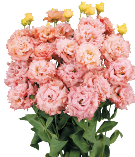
Celeb 2 Salmon Pink (F16-777)

Gorgeous flowers with wide petals and many layers. The color is classic salmon pink with a darker hue. The flowers are heavy, so make sure to keep the flower stems strong.