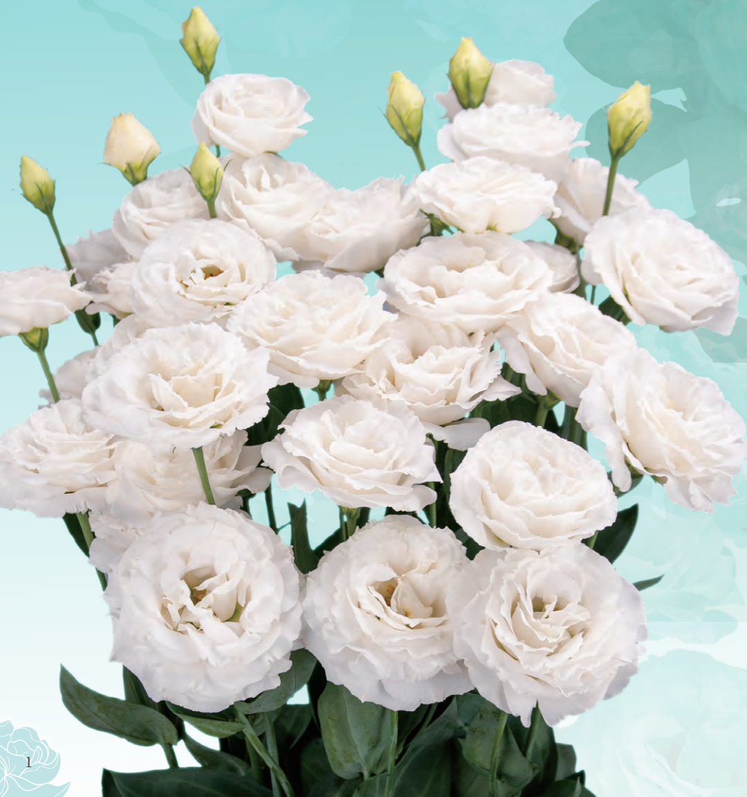
Prime 3 White ver.2 (F19-579)

It has good branching and produces voluminous cut flowers. Easy to grow and have a uniform height, inheriting the same characteristics as Prime 3 White.