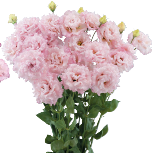
Celeb 2 Extra Pink (F16-776)

A Celeb series variety with gorgeous flowers with strong fringe. The stems are slender and soft, so be careful to neck droop.