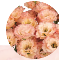
F21-031 Earliness : 1 Flower Size : Medium Rosetting : Less sensitive