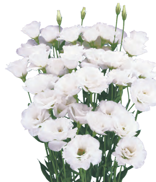
Megalo 2 White (F07-943)

Pure white, medium-large double flowers. It has many nodes and is easy to grow tall, but be careful of stem breakage.