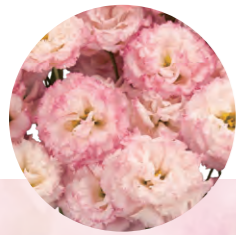
F20-288 Earliness : 2 Flower Size : Large Rosetting : Sensitive