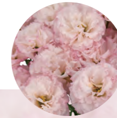
F21-052 Earliness : 2 Flower Size : Mid-Large Rosetting : Less sensitive