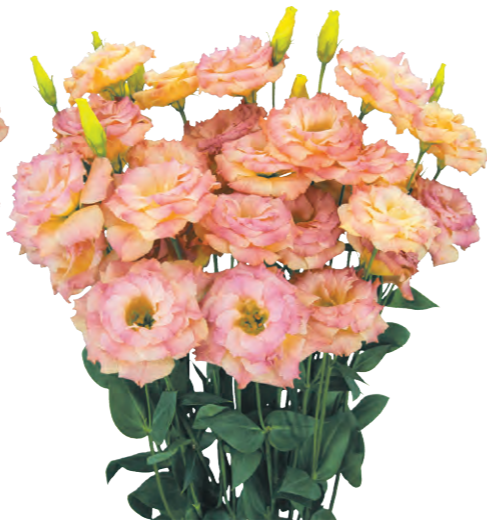
Megalo 2 Deep Orange (F11-923)

This variety maintains a flash color even in low light conditions. It has a deeper orange color than Megalo 2 Champagne.