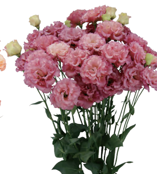
Celeb 1 Rouge (F07-537)

Rose pink petals with strong fringes. Since it blooms early and has a short plant height, it is more suitable for winter production.