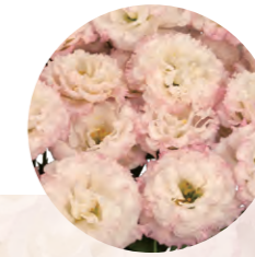
F19-469 Earliness : 2 Flower Size : Mid-Large Rosetting : Less sensitive