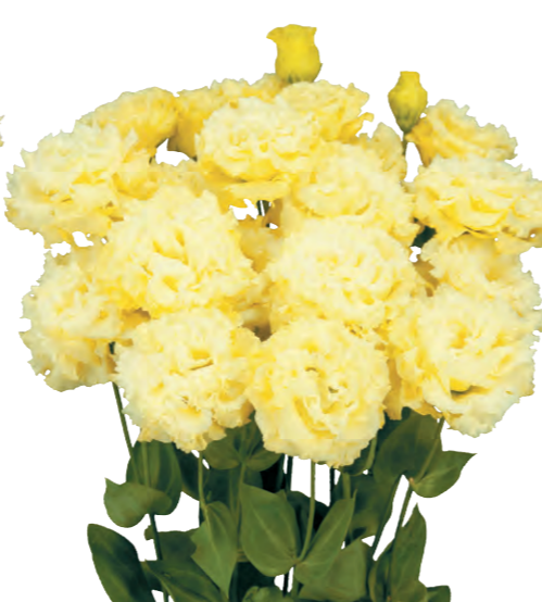
Celeb 3 Yellow (F17-315)

The internodes are shorter than those of Celeb 2 Yellow, and the stems are sturdy and grow slowly. Improved petal overlap and fringing when flowering in high temperatures.