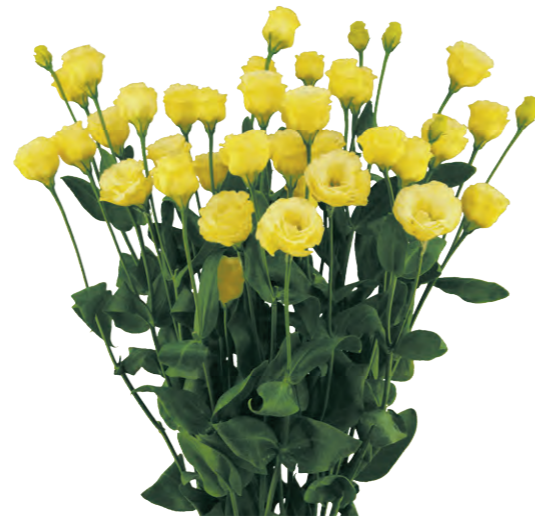
Little Summer 1 Gold (F06-040)

Bright yellow variety with small, cup-shaped flowers. The flowers are compact and tight.