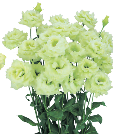
Celeb 2 Mint Green (F10-521)

A refreshing green color with no yellowish tinge. The flower shape is similar to Celeb 2 Yellow, but the plant height is slightly lower.