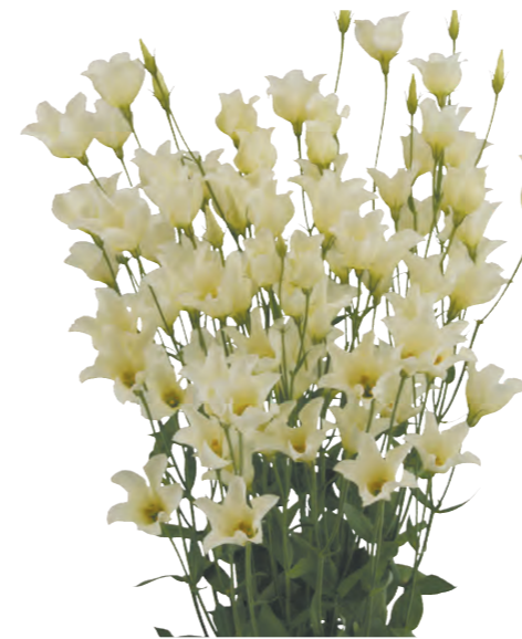
Macherie Green (F07-948)

Pale green. A little slower than Macherie White.