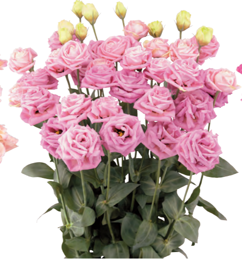
Arosa 3 Pink ver.2 (F16-956)

Small, curled rose-like flowers, slightly dark pink, slightly heavy.