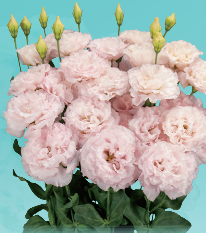
Celeb 2 Silky Pink (F18-209)

Breeding, for us, is a commitment to enriching life through color. With advanced techniques and true horticultural passion, we develop varieties that offer beauty, reliability, and emotional resonance. We are proud to present these new possibilities.