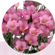
F20-919 Earliness : 2 Flower Size : Small Rosetting : No data