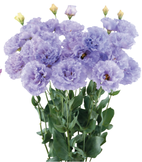
Celeb 2 Amethyst (F17-610) Vibrant deep lavender color. The petals have fringes at the tips. The petals are sturdier than other light lavender varieties. Be careful of flower neck drooping.