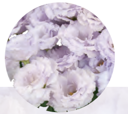
F19-124 Earliness : 3 Flower Size : Large Rosetting : Very sensitive