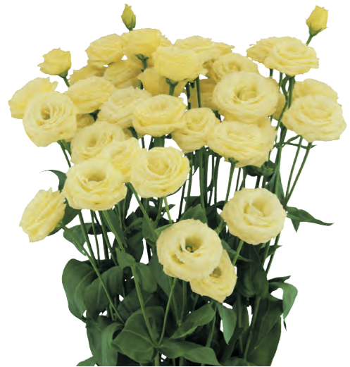
Arosa 2 Yellow (F08-940)

Small, clear yellow flower with many petals. Tight, cup-shaped flower. Gives many branches.