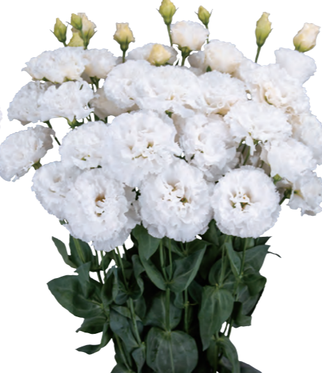
Celeb 2 Pink (F09-106)

A long-selling variety. This vibrant pink blooms beautifully and does not fade easily. The flowers open wide, creating a voluminous appearance.