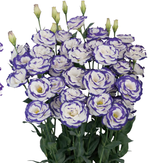
Megalo 3 Blue Picotee Imp. (F13-929) Suitable for summer cultivation in cool regions. Reduced flower neck breakage. It maintains a clear, wide border even in summer. No short-day treatment (shading) is required.