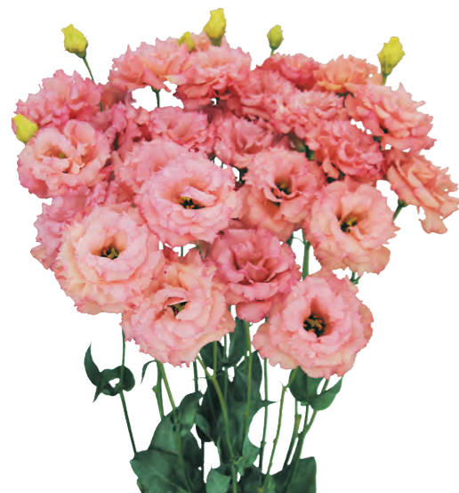
Celeb 2 Honey Pink (F11-139)

Pinkish apricot variety with relatively thick stem. The apricot color appears better in colder seasons. The plant is tall and easy to grow.