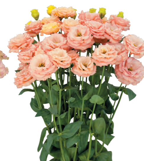
Sabrina 1 Orange (F14-051)

This variety has hard petals and it is more vigorous than Little Summer series. The flower position is higher, making it easier to cultivate. The flowers are larger, with more fringes and petals.