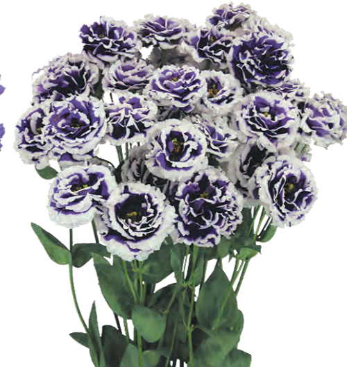
Celeb 2 Turn Blue (F11-079) This variety has a good balance of flower shape, plant height, branching, and plant form, making it easy to cultivate and suitable for cultivation in a wide range of seasons.