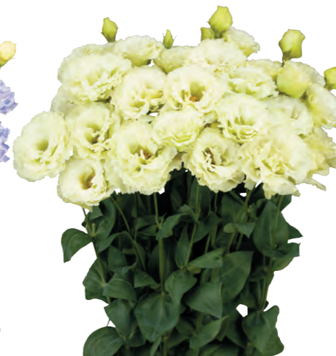
Elegance 3 Green (F16-397) A standard green double flower with good plant height, many branches, and stiff stems. Suitable for winter production in warm regions and summer production in cool regions.