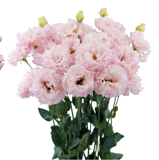
Celeb 2 Queen (F16-390)

Very large and gorgeous, light pink flower. The petals are quite strong despite the large size. It has strong vigor and tends to overgrow, so watering should be controlled well.