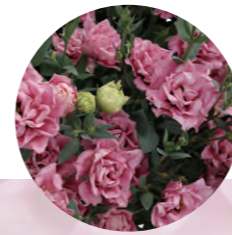
F20-956 Earliness : 3 Flower Size : Small Rosetting : No data