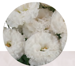
F20-254 Earliness : 1.5 Flower Size : Mid-Large Rosetting : Less sensitive