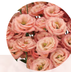
F19-093 Earliness : 2.5 Flower Size : Medium Rosetting : No data