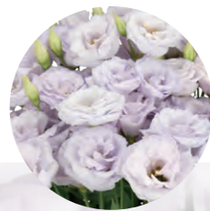
F18-041 Earliness : 2.5 Flower Size : Medium Rosetting : Average