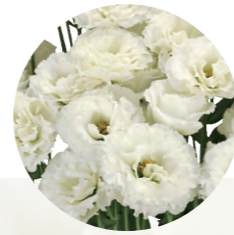
F17-199 Earliness : 2 Flower Size : Mid-Large Rosetting : Less sensitive