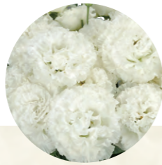
F20-292 Earliness : 2 Flower Size : Large Rosetting : Less sensitive