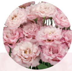
F20-490 Earliness : 3 Flower Size : Large Rosetting : Very sensitive