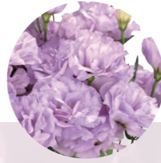
F18-040 Earliness : 2 Flower Size : Medium Rosetting : Less sensitive