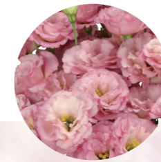
F19-518 Earliness : 1.5 Flower Size : Mid-Small Rosetting : Less sensitive