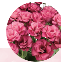
F19-962 Earliness : 3 Flower Size : Small Rosetting : Less sensitive