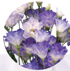
F20-419 Earliness : 1 Flower Size : Small Rosetting : Average