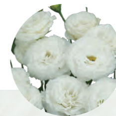
F20-250 Earliness : 4 Flower Size : Medium Rosetting : No data