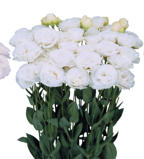
Wedding 2 Kiss (F16-343)

A small white flower that blooms mid-season to mid-late. If you reduce the amount of watering, the flowers will be small size.