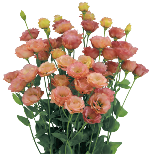
Little Summer 1 Orange (F02-015)

This variety is early-maturing and blooms low, so the cultivation period is limited, but the thickness of the petals is highly praised by growers. Be careful not to let the outer petals get sunburned.