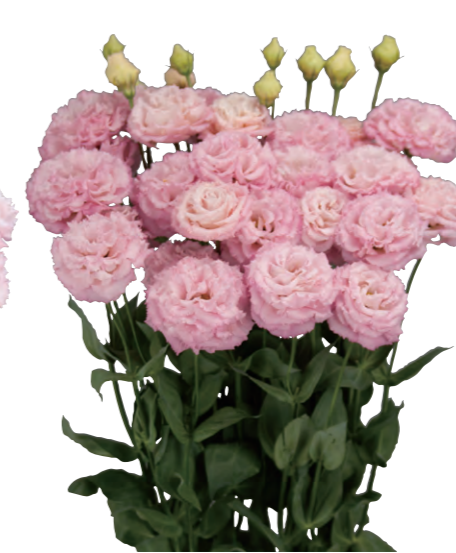
Celeb 2 Pink Mimi (F19-660)

The petals are densely packed and cup-shaped. The lower the temperature during flowering, the more petals there will be. This plant is relatively less vigorous, so be careful of chip burn.