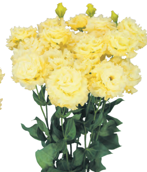
Celeb 2 Gold (F11-609)

When they bloom in cooler temperatures, the gorgeous flowers have so many petals that the center is barely visible. The flowers become heavy, so trim the and make the flower stalk firmer.