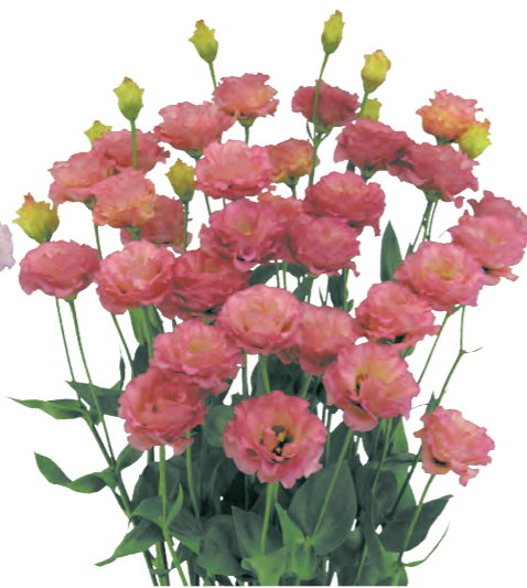
Little Summer 2 Deep Pink (F01-155)

A special deep pink variety. The flowers are small and the petals are hard.