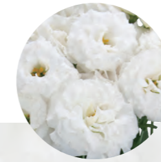
F19-435 Earliness : 2.5 Flower Size : Large Rosetting : Less sensitive