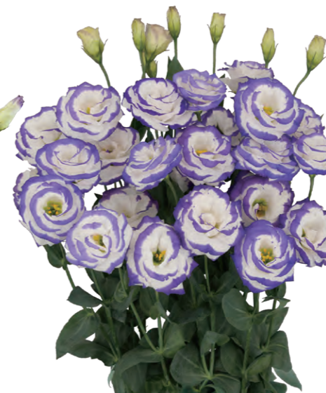
Arosa 3 Blue Picotee (F13-374) The color of the border remains thick even during the summer. The number of petals is large and the border color is blue-purple. The plant height is easy to maintain.