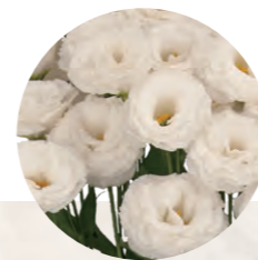
F20-235 Earliness : 2 Flower Size : Medium Rosetting : Less sensitive