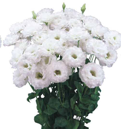
Celeb 3 White (F19-444)

It is characterized by its pure white color and uniformity. Keeping it well-watered even after buds appear will increase the volume of the flowers.