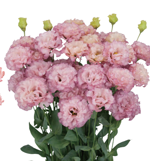
Celeb 2 Madonna (F12-486)

A deep pink color. A Celeb-series variety that is relatively easy to cultivate. The color is darker at the petal edge and has a gradation.