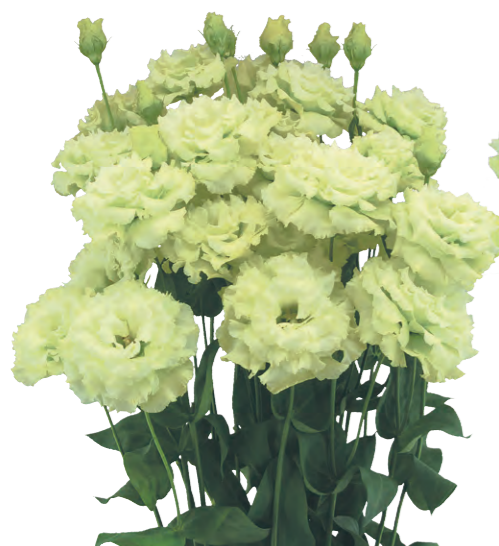
Celeb 2 Green (F07-064)

Yellowish lime green color. The petals are layered and suitable for blooming in hot weather. The green color gets strong in periods of strong daylight.