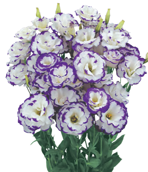
Megalo 3 Blue Picotee Max (F10-902) A picotee variety with flower size comparable to the Celeb series. Easy to grow with few stem breakage.