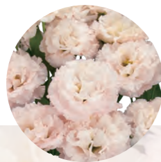
F18-247 Earliness : 2 Flower Size : Mid-Large Rosetting : Less sensitive