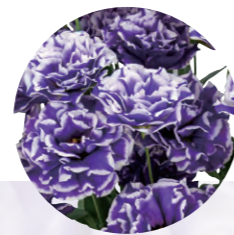
F18-227 Earliness : 1.5 Flower Size : Medium Rosetting : Less sensitive