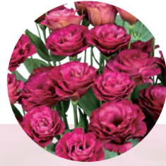
F21-983 Earliness : 3 Flower Size : Small Rosetting : Sensitive