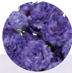
F20-492 Earliness : 2 Flower Size : Mid-Large Rosetting : No data