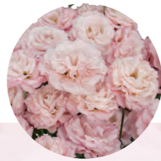
F21-011 Earliness : 2 Flower Size : Mid-Small Rosetting : Less sensitive