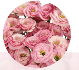
F19-534 Earliness : 2 Flower Size : Small Rosetting : Average