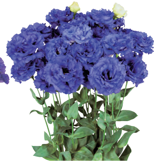
Celeb 2 Night Blue (F16-325) The flowers are large and crystal-shaped. They grow tall and well-balanced even in autumn and winter cultivation.