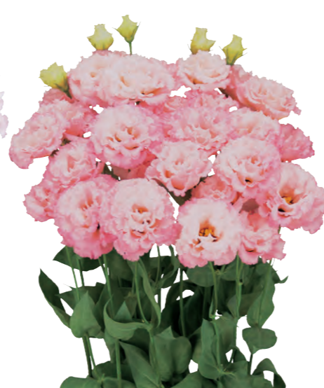
Celeb 3 Pink (F18-818)

Outstanding flower shape with its wide petals and loose fringe. A mid-late bloomer, one of the few in the Celeb Pink range.