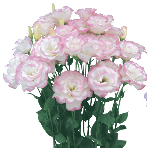
Megalo 2 Pink Picotee (F09-566) A medium-early maturing, large-flowered pink picotee. It is not a very vigorous variety, so make sure to grow it strong as you would for over-wintering cultivation to ensure a good volume.