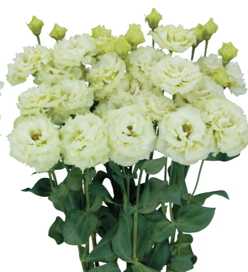
Celeb 3 Green (F14-375)

A refreshing green color with no yellowish tinge. The stems are stiff and suitable for over-summer cultivation. It has a lot of vigor and large leaves, so be careful of chip burn.