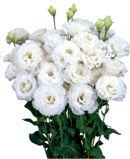
Celeb 3 Crystal (F19-431)

Mid-late variety with sturdy stems. Good choice for those who have trouble with the soft stems of Celeb 2 White in warm season. Can be grown in relay with Celeb 2 Crystal.