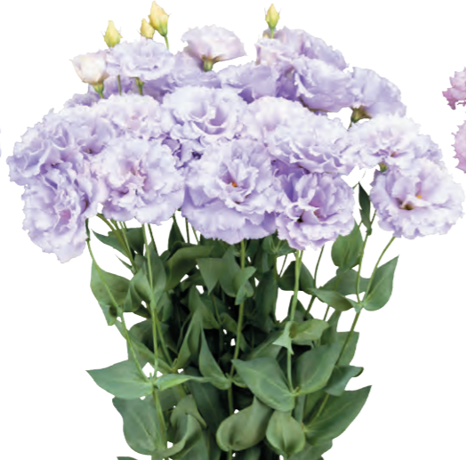
Celeb 2 Deep Lavender (F17-601) A deep lavender variety with weak fringe but large flowers. The plant's appearance is similar to that of Blue Chateau.