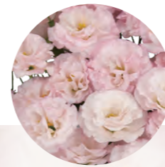
F19-505 Earliness : 1.5 Flower Size : Mid-Small Rosetting : Less sensitive