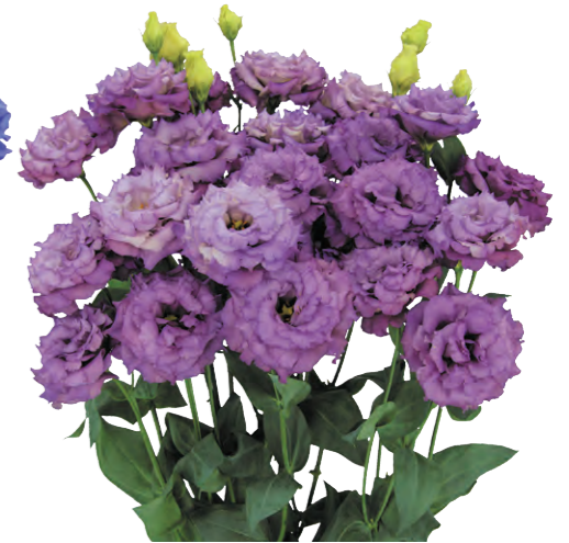
Celeb 2 Metallic Blue (F11-648) A mysterious color that is a mixture of lavender and purple. A vigorous variety with large flower size. Be careful of sun burn.