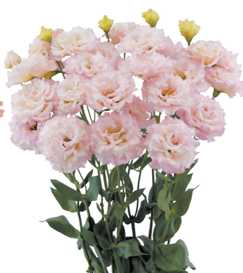
Celeb 2 Misty Pink (F16-706)

A pale pink, large-flowered variety. The stems are hard, so it is suitable for early summer cultivation.