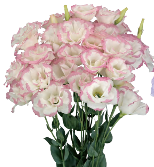
Megalo 2 Pink Picotee Imp. (F12-711) The flower shape has been improved from Megalo 2 Pink Picotee, with the outer petals less open. Stiff stem, top flowering.