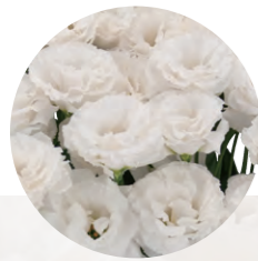
F17-975 Earliness : 2 Flower Size : Medium Rosetting : Less sensitive