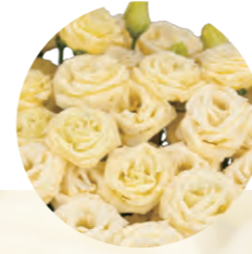
F21-961 Earliness : 3 Flower Size : Mid-Small Rosetting : Average