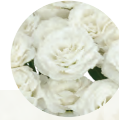
F21-963 Earliness : 3 Flower Size : Medium Rosetting : Less sensitive