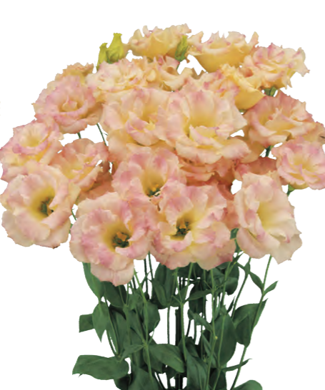
Megalo 2 Champagne (F10-943)

A voluminous, large yellow-pink flash variety. The plant is tall and easy to cultivate.