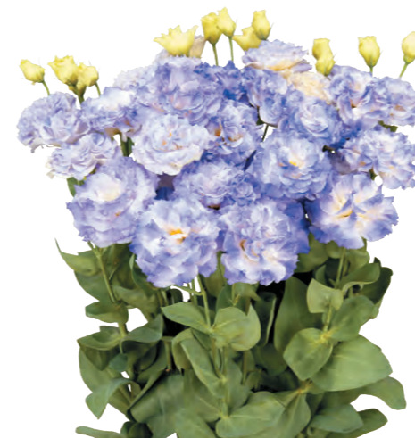
Megalo 4 Blue Squash (F17-327) This late-maturing blue flash variety which grows well and produces beautiful flowers even in hot season. The stems are thick and strong.