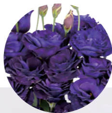
F18-286 Earliness : 3 Flower Size : Small Rosetting : Sensitive