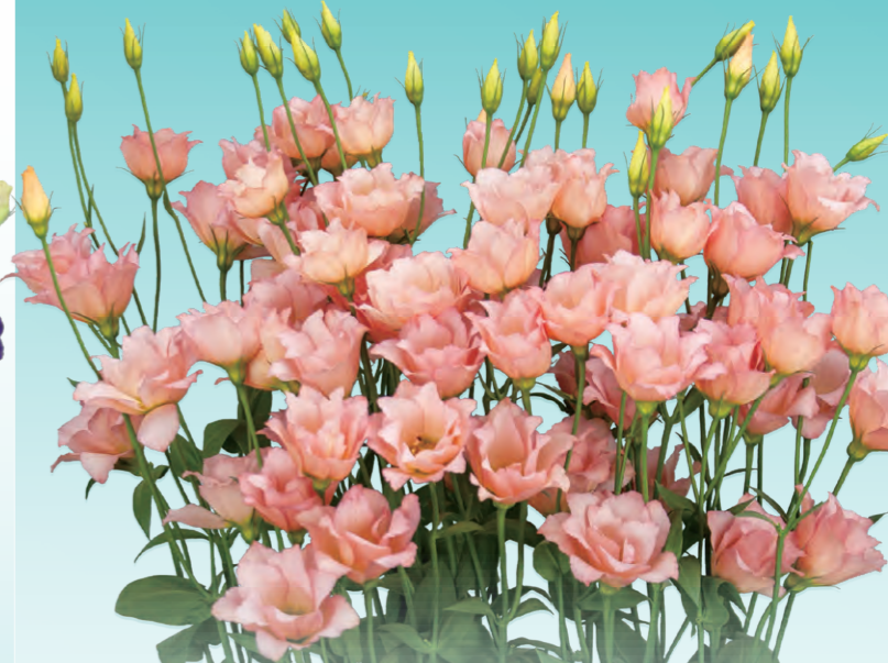
Macheriena Apricot (F20-201)

A deep apricot color variety with a unique sword-shaped petal. Some single petals are mixed in. In high temperatures, they become single petals.