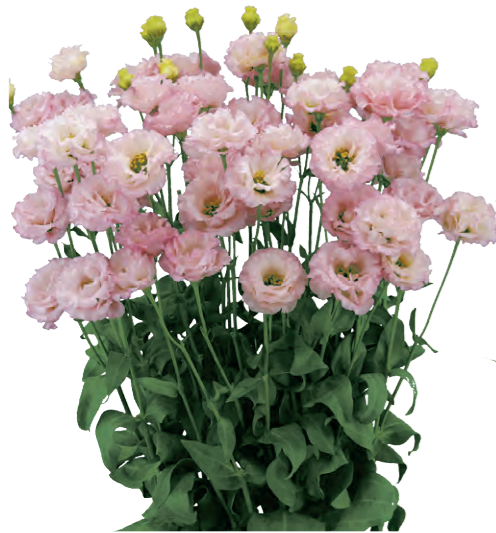
Little Summer 1 Princess (F07-524)

It has beautiful colors and thick fringed petals. The plant vigor is weak, so it is difficult to get it to bloom in winter. However, once you master it, you will become addicted to this variety.