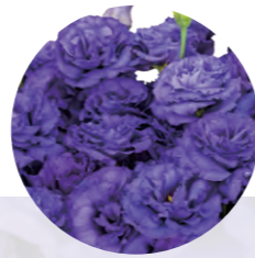
F16-353 Earliness : 1.5 Flower Size : Mid-Small Rosetting : Less sensitive