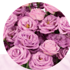
F19-024 Earliness : 1.5 Flower Size : Mid-Small Rosetting : No data