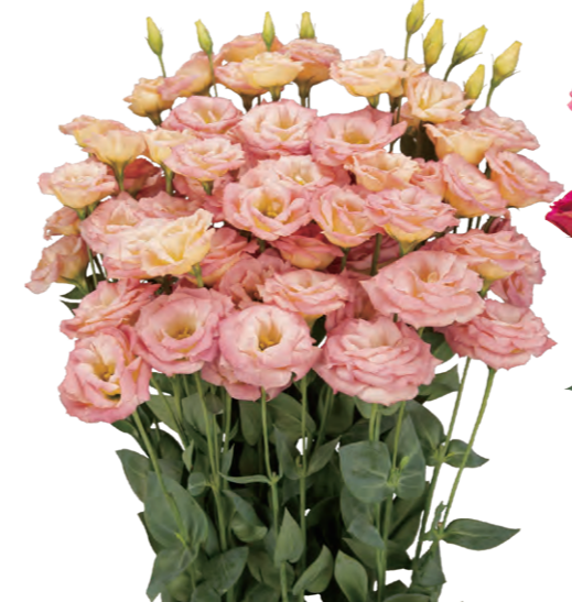
Arosa 3 Champagne ver.2 (F18-202)

The flowers are more compact than Arosa 3 Champagne. Internode growth is also suppressed.