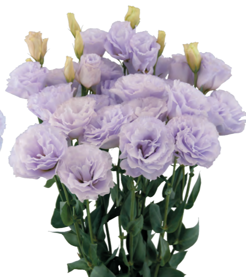
Megalo 2 Light Wisteria (F15-863) Pale lavender variety with round petals. The internodes are tight and the plant is relatively short. An elegant looking variety with round petals.