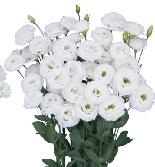
Arosa 4 Pure White (F13-460) A white double-flowered variety that grows tall and voluminous. Suitable for summer cultivation in cool regions, it grows tall even without shade.