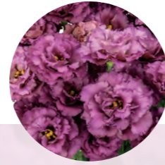
F20-921 Earliness : 2 Flower Size : Mid-Large Rosetting : Less sensitive