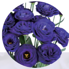
F20-450 Earliness : 4 Flower Size : Mid-Small Rosetting : Very sensitive