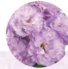
F21-129 Earliness : 2 Flower Size : Large Rosetting : No data