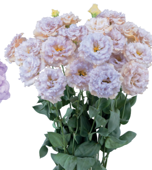
Blue Chateau (F14-744) A large-flowered variety with a unique yellow and lavender color. The flower shape is similar to that of the Celeb series. The stem is relatively thin.