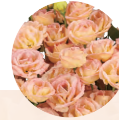
F21-453 Earliness : 4 Flower Size : Medium Rosetting : Sensitive