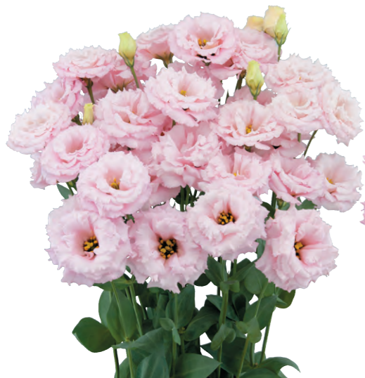
Celeb 2 Pretty (F16-349)

Light pink variety with medium flower size. It branches well even in cool temperatures and is easy to cultivate with little blasting. It has strong vigor, so be careful of overgrowing in winter.