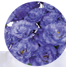
F19-027 Earliness : 3 Flower Size : Large Rosetting : Average