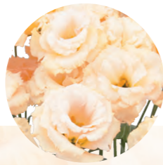
F14-743 Earliness : 1.5 Flower Size : Medium Rosetting : Less sensitive

Also, the characteristics of the varieties listed may not be accurate.