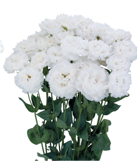
Celeb 2 Crystal (F14-479)

Vigorous and easy to grow, with easy height control. It has large flowers with strong fringe. Because it is so vigorous, be careful of stem breakage during the growing period.