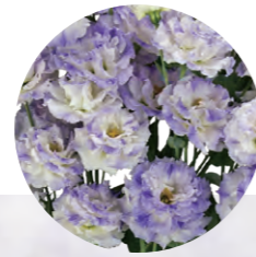
F20-468 Earliness : 2 Flower Size : Medium Rosetting : No data