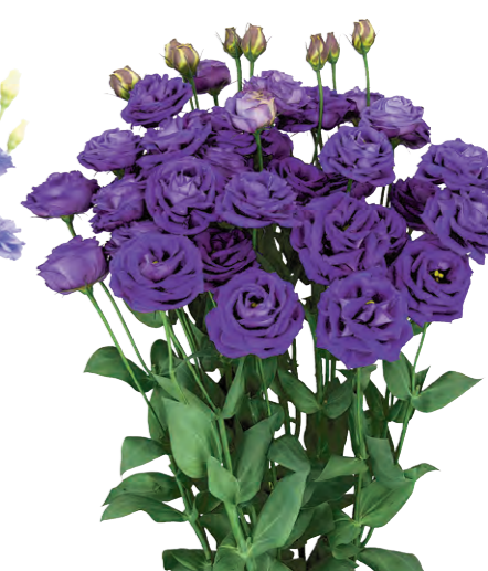
Arosa 3 Blue (F11-854) Blue, medium to small sized flowers. Even in autumn, the plant is tall and has many branches.