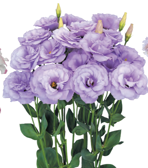
Megalo 3 Lavender imp. (F11-424) It has many branches and flowers, making it easy to cultivate, and is advantageous when grown in hot season.