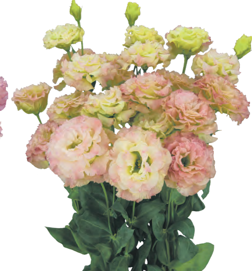
Celeb 2 Pink Diamond (F12-832)

The green and pink colors create a classic atmosphere. The many overlapping petals of the flower resemble a rose when it is about to open.