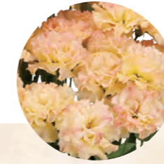
F21-422 Earliness : 2 Flower Size : Medium Rosetting : Sensitive