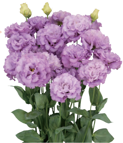
Celeb 2 Grape (F12-036) This reddish lavender variety has stronger petals than the other large-flowered lavender varieties. Stems are hard. Widely cultivated and proven variety.