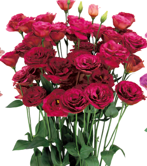
Arosa 3 Red (F11-851)

Deep red variety, the more sunlight there is, the darker it becomes. Be careful of tipburn and rosetting.