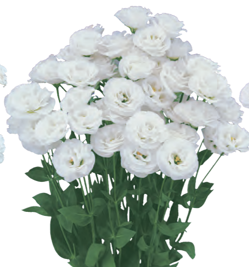
Arosa 3 Pure White (F10-923) A strong-stemmed, rose-like shape, double-flowered variety with a pure white color.