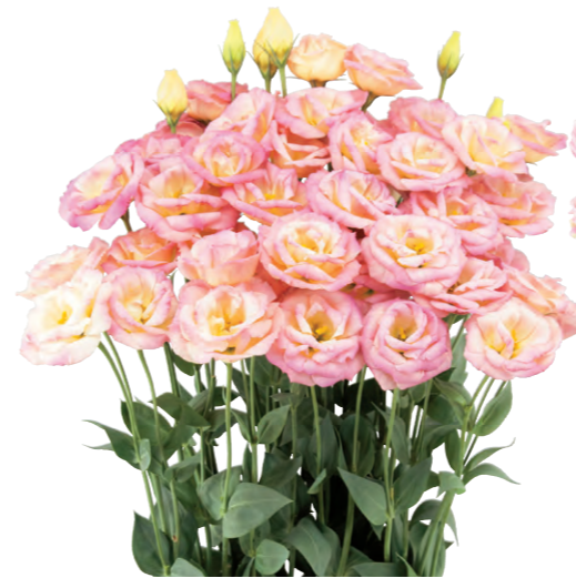
Arosa 3 Champagne (F15-324)

The plant grows tall but has strong stems. Ideal for autumn harvest.