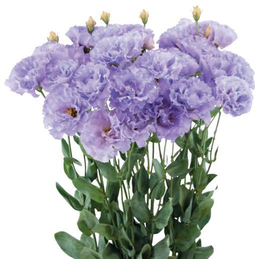
Celeb 2 Amethyst ver.2 (F17-609) The hardness of the flower neck of Celeb 2 Amethyst has been improved. Other features are almost the same.