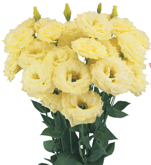
Megalo 2 Yellow (F08-937)

The plant height and branching are well balanced, and the stems are strong. It produces many petals even in hot weather, and has a standard yellow double flower. Popular in Brazil.