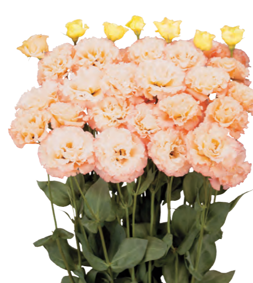
Celeb 2 Apricot (F17-716)

Clear apricot color. Large, overlapping flowers. The leaves are large, so be careful of tip burn. It is relatively sensitive to rosetting, so cooling during seedling stage is important.