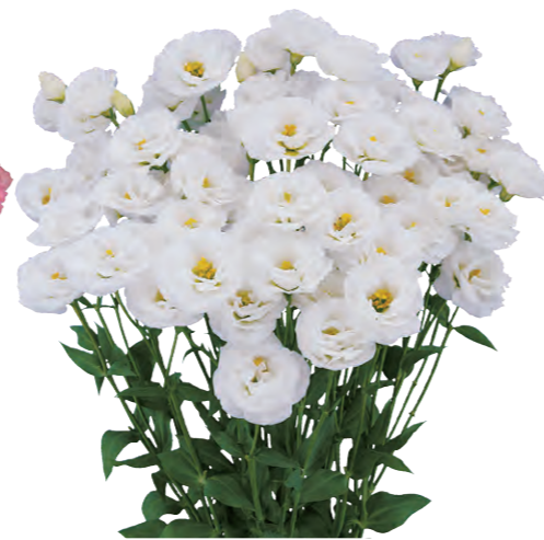
Little Summer 3 White (F10-547)

Rose-like shape flower with good fringes. Gives many flowers, top flowering.