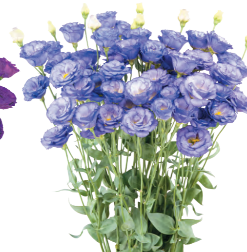
Arosa 1 Sky Blue (F14-037) A refreshing light blue color with green center. The petals are stronger than those of lavender varieties. When it blooms in winter, it turns a bright blue-purple color.