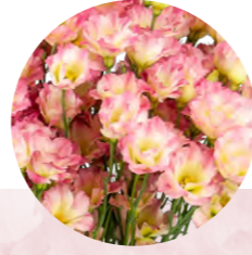
F20-915 Earliness : 2 Flower Size : Small Rosetting : Less sensitive