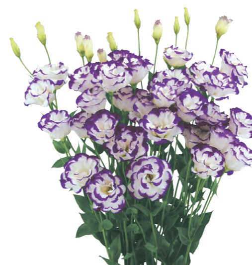
Megalo 2 Blue Picotee (F01-217) Even after 20 years since its launch, it remains popular for its ease of cultivation and is a standard blue picotee variety. The blue border will become smaller in higher temperatures.