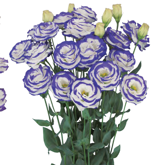
Arosa 4 Blue Picotee (F13-375) The border color is a deep purple, creating a clear contrast. It is a late-maturing plant that grows tall even in hot weather, and does not require short-day treatment (shading).