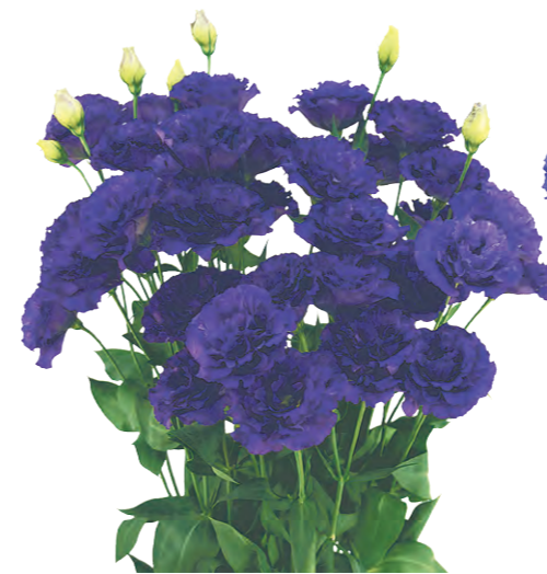
Celeb 1 Blue (F05-049) When grown in cooler temperatures, it has good uniformity, and has many branches, making it easy to bloom. Please note that in hotter temperatures, the color fades in a marbled pattern.