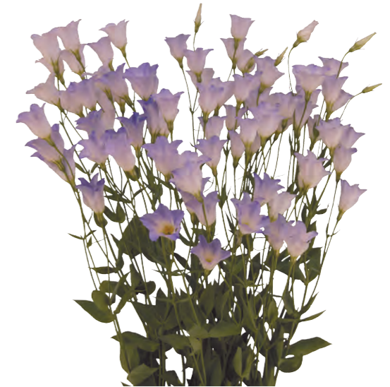
Macherie Squash (F07-949)

Pale blue flash color. In low sunlight, the color will not develop and will turn white.