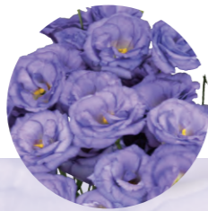
F18-002 Earliness : 1 Flower Size : Medium Rosetting : Less sensitive