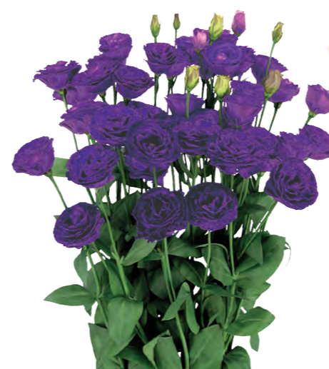
Arosa 3 Violet (F11-845) Glossy deep purple, small cup-shaped double flowers. Be careful of tip burn and rosetting.