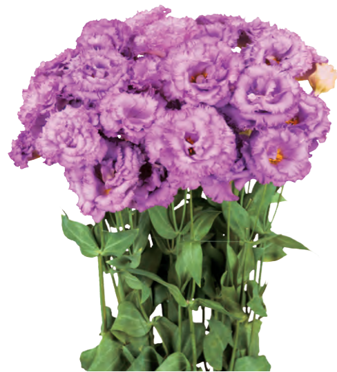
Celeb 1 Lilac (F16-157) A vibrant red wine colored Celeb variety. Excellent low temperature flowering, suitable for winter flowering in temperate region.