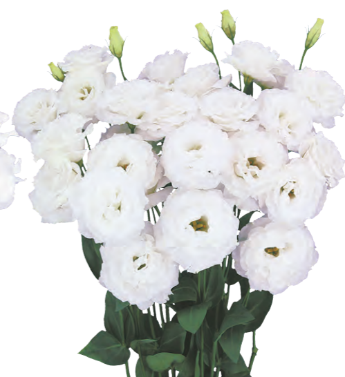
Megalo 3 Mega White (F10-925)

Large, double-flowered, white, round-petaled variety with sturdy stems that allow them to grow tall even in hot weather.