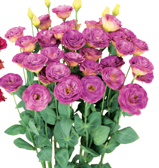
Arosa 3 Wine Flash (F14-904)

Small double cup-shaped flowers, impressive wine flash color. Be careful of tip burn and rosetting.