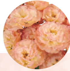
F20-950 Earliness : 3 Flower Size : Large Rosetting : Average