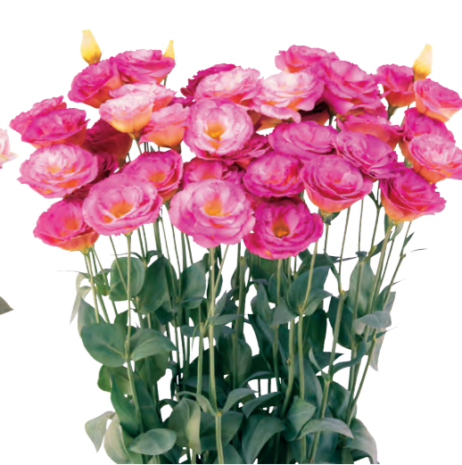
Arosa 3 Red Flash (F16-945)

Small double cup-shaped flowers, vibrant red flash, be careful of tip burn.