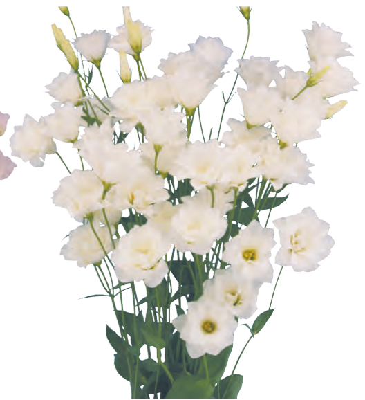
Macheriena White (F07-291)

Small to medium-sized double variety with sword-shaped petals. The flower color is milky white.