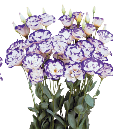
Megalo 2 Blue Picotee ver.2 (F16-302) A blue picotee variety with a deep border color. Easy to grow tall. Suitable for high temperatures.