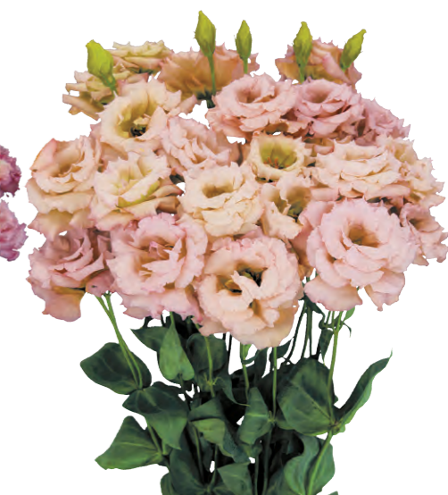
Celeb 1 Beige Neo (F10-514)

A medium-large flower with a green-pink color, early maturing but tall enough, a popular variety in North America.