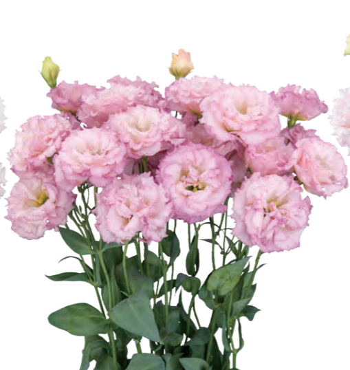
Celeb 2 Pearl Pink (F14-032)

The flowers are pale pink, with a darker color at the tips of the petals. Green center. When growing in winter, be careful as the color may become too pale if there is little sunlight.