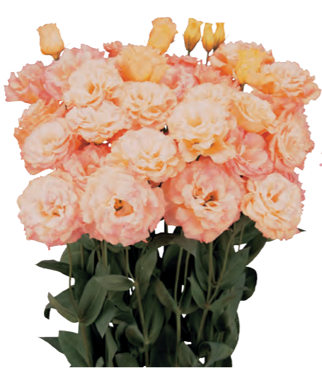
Elegance 3 Champagne (F18-225)

A late-maturing variety that is easy to grow tall. Even in hot weather, it produces many petals and maintains a well-formed flower shape. The color is intense and uniform.