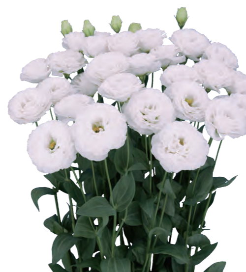
Prime 3 White (F14-353)

This pure white variety has a well-formed flower shape. It produces many petals and maintains its height even in hot weather, making it ideal for highland summer cultivation.