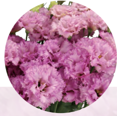
F20-927 Earliness : 2 Flower Size : Medium Rosetting : Average