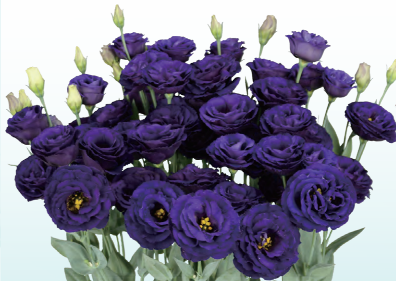
Arosa 4 Violet (F18-874)

A very deep purple Arosa type variety. The flowers are slightly larger than Arosa 3 Violet, with improved rosetting tolerance.